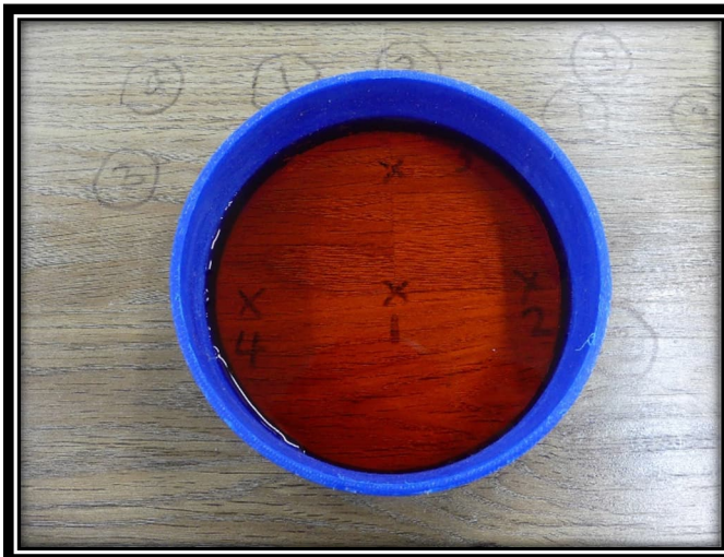
After 24 hrs With Water