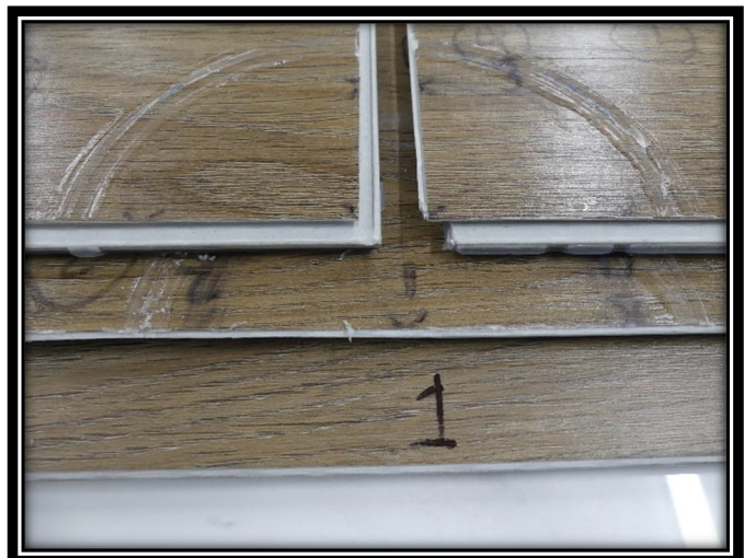
Recovered Swell (Disassembled)