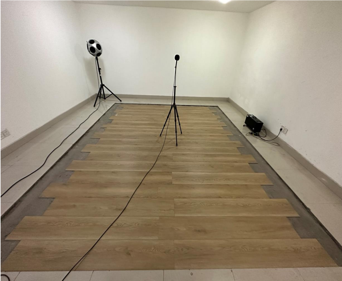
Test set up