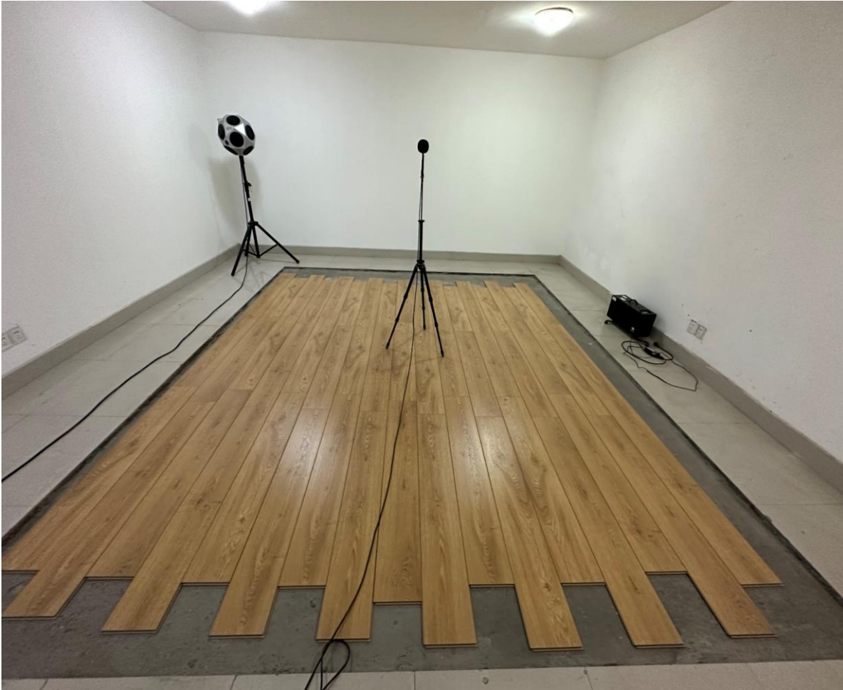
Test set up