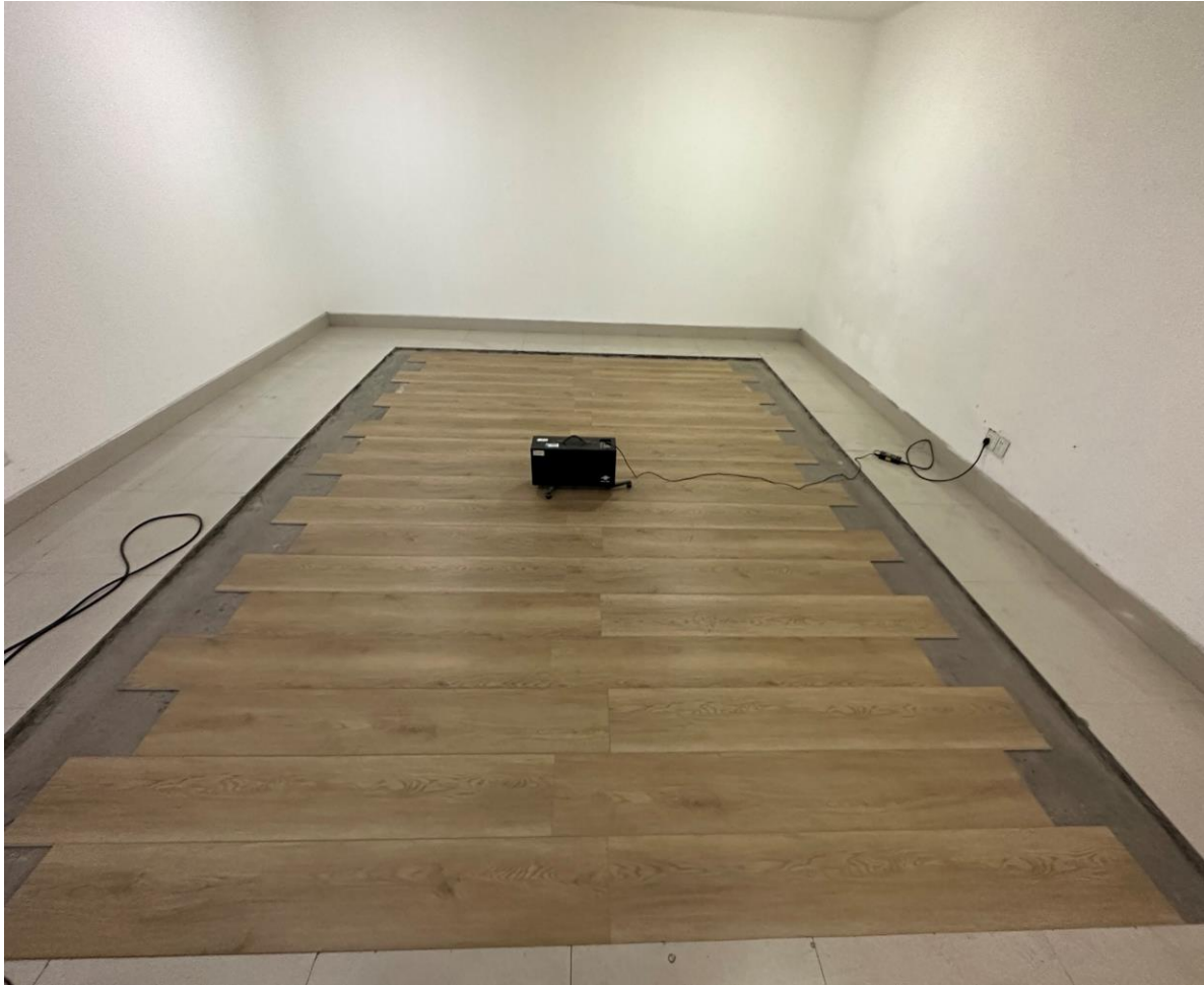
Test set up