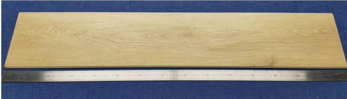
Front view(Test surface)