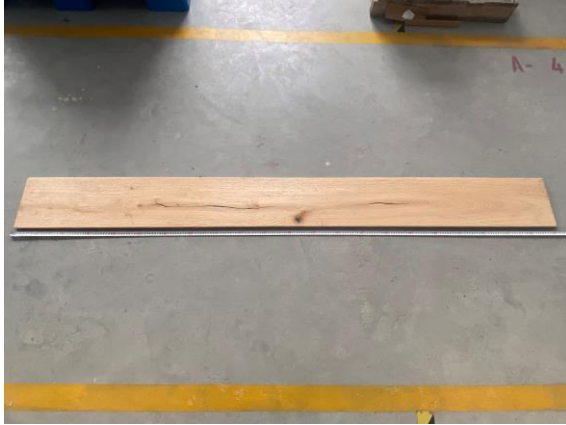
Front view(Test surface)