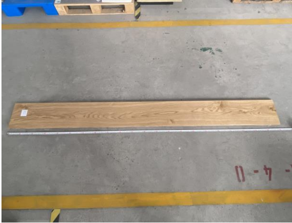
Front view(Test surface)